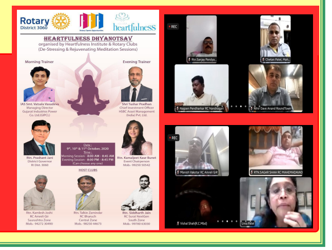
GIR Naad Volume 21 Dtd:- 05/11/2020 Page No.2

RC Amreli Gir as Host Club organized District project Heartfulness Dhyanotsav. This event was managed in 2 sessions, morning & evening sessions for 3 days, & in both these sessions more than 3500 peoples were given guidance on yoga and meditation.